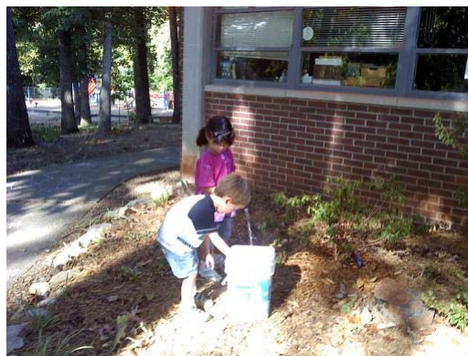
Young Clean Up Helpers